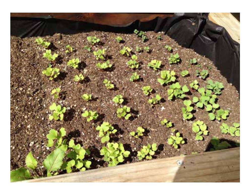
Fresh produce sprouting at the Villa Esperanza garden.

Esperanza is looking to build on prior efforts to train community health promoters, increase nutrition awareness among low-income residents, and build new garden beds so that more residents can continue to grow their own food. Through these efforts, Esperanza is building a promising model for achieving a healthier food environment in South Los Angeles. Looking ahead, Esperanza plans to work with community partners, city agencies, and residents to ensure that gardens are managed collectively and that community members are able to enjoy both nutrition education and increased access to fresh fruits and vegetables.