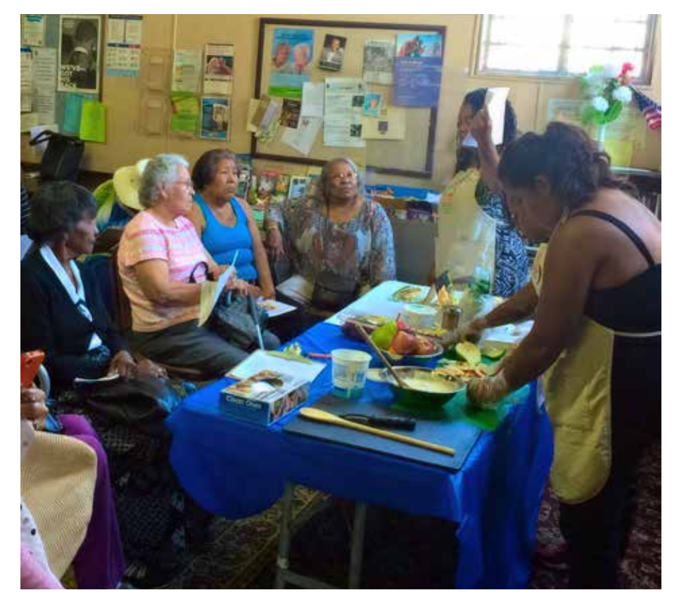
Champions for Change nutrition education class at Edward Vincent Senior Center.