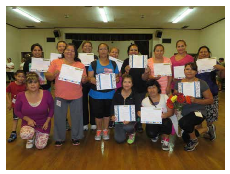
Champions for Change nutrition education class graduates.

" The Peer-to-Peer program is a model that prioritizes engagement from residents, particularly among Latino and African American communities in Lynwood and Compton. Most educators are from the community itself, allowing a safe space for participants to share any challenges they have related to healthy eating."