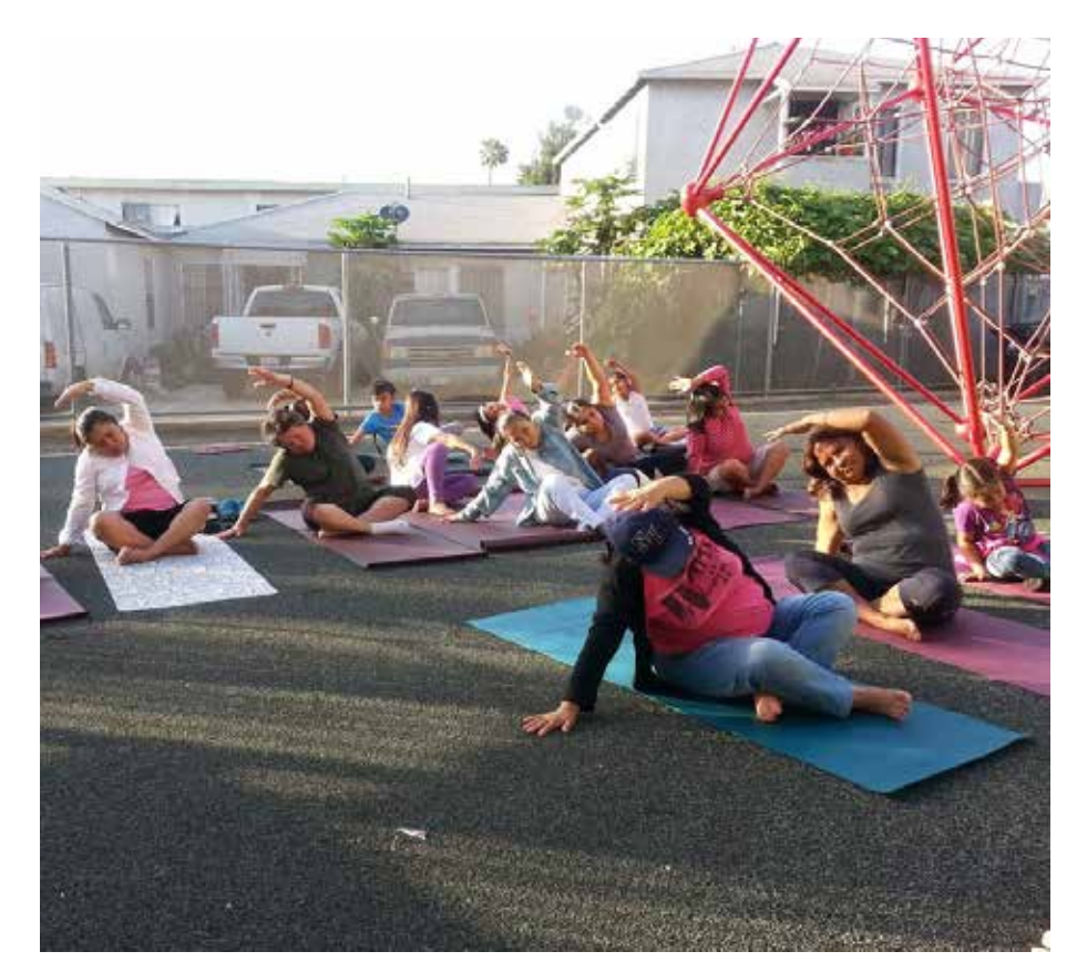
Yoga at 11th Avenue Park as part of Champions for Change nutrition education classes.