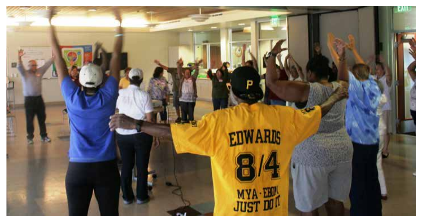
Champions for Change nutrition education class participants engaging in stretching activity at Lawndale Community Center.