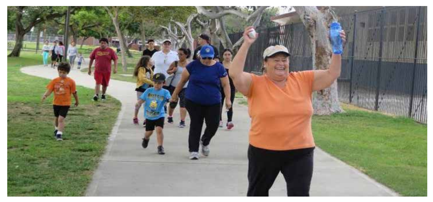
Vida Sana Walking Club.