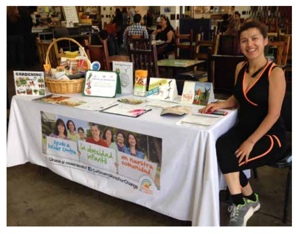
Champions for Change nutrition education class promotion table at Mercado La Paloma.