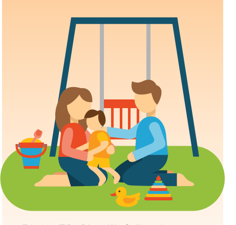
Frieden, T.R., Dietz, W., Collins, J., 2010. Reducing childhood obesity through policy change: acting now to prevent obesity. Health Aff. 29, 357–363.

" As with tobacco control, obesity prevention will require major policy and contextual changes. Comprehensive approaches involving multiple strategies and sectors and all relevant stakeholder groups will likely be needed to reverse the epidemic."