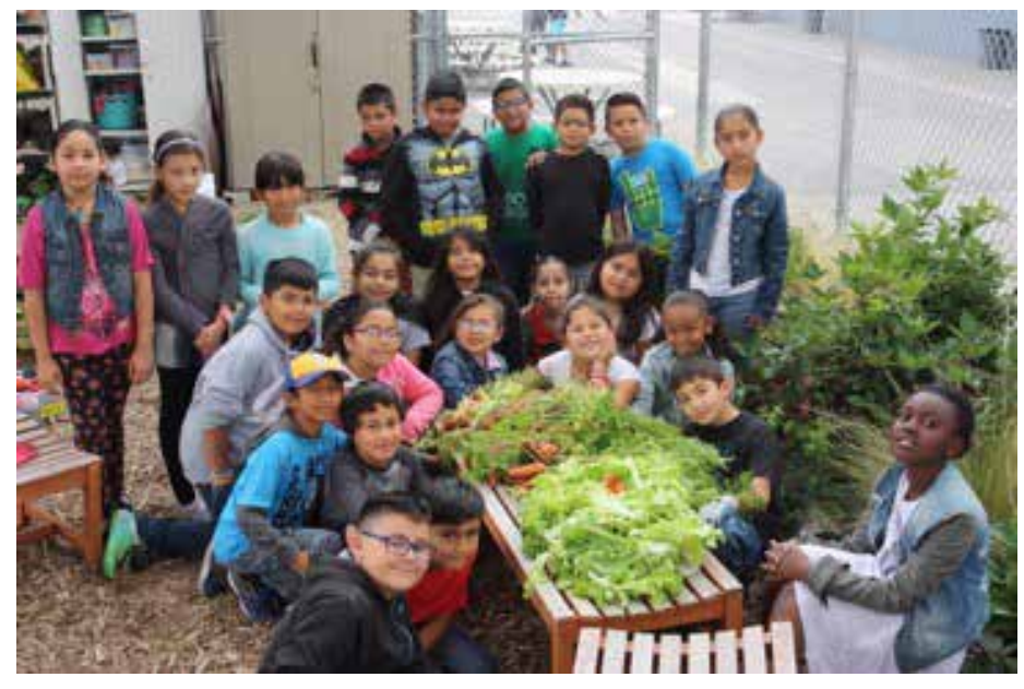
NEOP nutrition class participants at Lawndale Community Center.