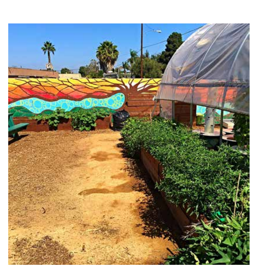
Community garden at Social Justice Learning Institute.

In 2014, SJLI partnered with the Los Angeles County Department of Public health to conduct community assessments in two Lennox neighborhoods. The results were used to develop SJLI's P2P implementation plan and showed many community residents had a strong interest in building community gardens as a means to improve access to healthy and affordable food. To build momentum, SJLI held meetings with school officials from Lennox Unified School District to discuss opportunities for a school garden program. Five schools were selected – Dolores Huerta Elementary, Moffett Elementary, Lennox Middle School, Buford Elementary, and Felton Elementary. Faculty and teachers at all five schools agreed that