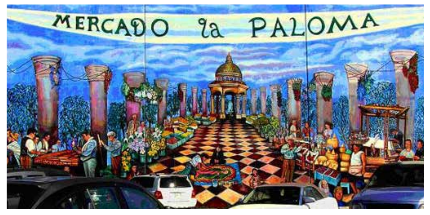
Mural at Mercado La Paloma<sup>1</sup>