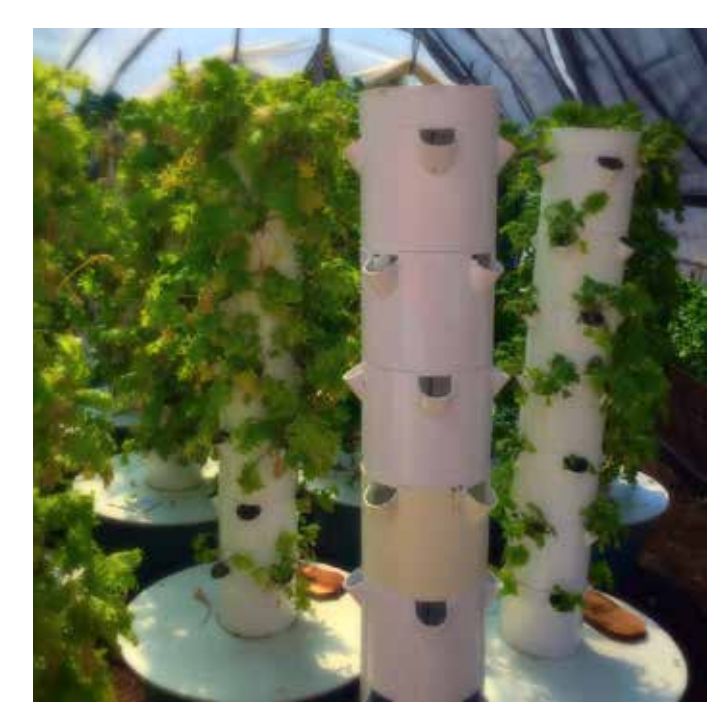
Aeroponic vertical gardens at Social Justice Learning Institute.

The Inglewood farmers' market demonstrates the importance of implementing place-based nutrition initiatives in addition to providing peer education, to make it easier for residents to make healthier choices. By moving beyond promotion, SJLI is using P2P education and community support to improve local residents' access to fruits and vegetables, and to improve health outcomes in Inglewood and Lennox.