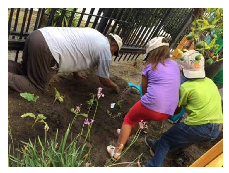
Community residents planting in edible church gardens.

Based on participant feedback, St. Francis decided to work with local church leaders to explore opportunities to improve the food and beverages offered at church functions, typically high in sugar, fat, and salt. St. Francis established a collaborative of church-goers and congregation leaders from the Health Ministry at Our Lady of Victory Catholic Church and other local churches. With support from St. Francis, Health Ministry members developed a draft policy of healthy food guidelines that recommended fruits and vegetables during meals, a wider variety