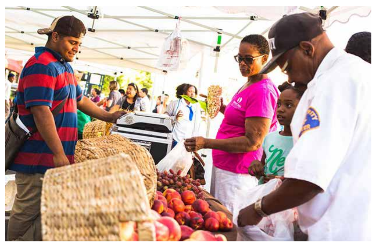
Inglewood Farmers' Market.