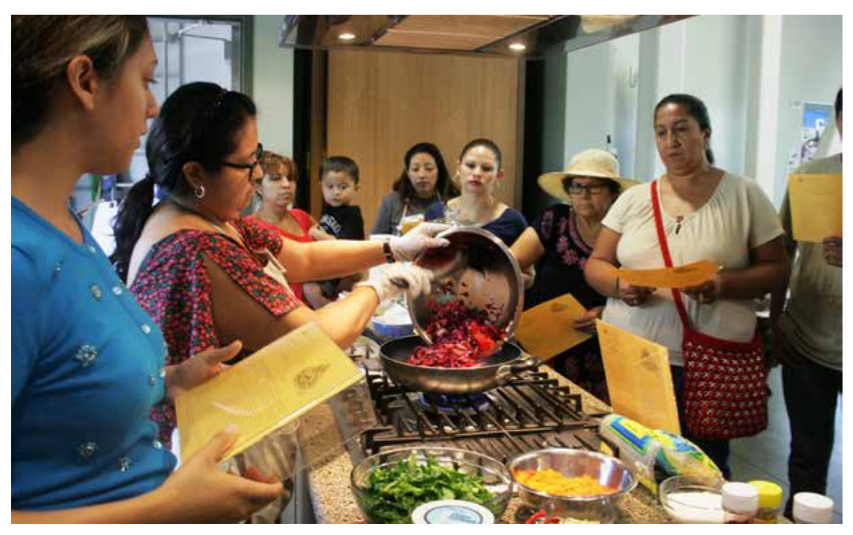
Champions for Change nutrition education class at the Central Avenue farmers' market.