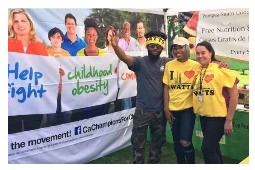
Champions for Change nutrition education class participants at Lawndale Community Center.

The Pompea Smith Good Cooking/ Buena Cocina Nutrition Education Program is hands-on. Weekly cooking demonstrations feature seasonal fruits and vegetables sourced right from the market. To engage South LA's deeply rooted Latino population, nutrition education is also offered in Spanish, allowing participants and peer educators to redefine traditional meal preparation by substituting healthier, flavorful ingredients. "SEE-LA's model is unique in that we are running our nutrition classes right inside the farmers' market," mentions Cara Elio. "When the class is over, participants can step out into the market and shop for fresh fruits and vegetables