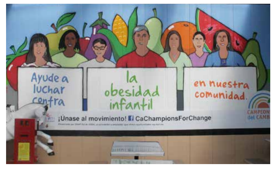
Mural along the perimeter of La Fiesta Market.

example, was within one mile of eight Lawndale schools, and store owners Martin and Maria Ramirez expressed immediate interest in making healthier options more readily available. LESD began working with La Fiesta to reconfigure sections of the store to make healthier choices more obvious and appealing.