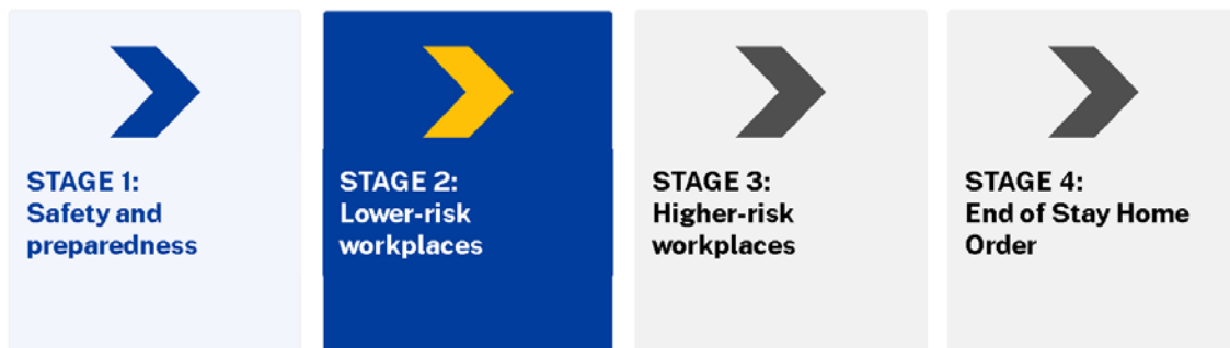
Figure 1. California's Pandemic Resilience Roadmap

(retrieved on June 3, 2020 at https://covid19.ca.gov/roadmap/ )