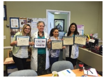
Special thanks to El Proyecto del Barrio staff for participating in the CPSP Tdap Project

Pilot project expansion: We expanded our Tdap project to El Proyecto del Barrio clinics in Azusa and Arleta.