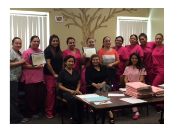
Winnetka staff – thanks for participating in our Tdap project as our 1st pilot clinic

Pilot project expansion: We expanded our Tdap project to El Proyecto del Barrio clinics in Azusa and Arleta.