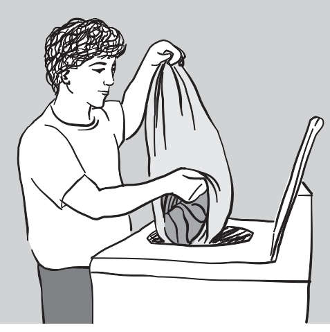
Wash work clothes separately from all other clothes. Empty your work clothes from the plastic bag directly into the washing machine and wash them. Run the empty washing machine again to rinse out the lead. (It is better if your employer washes the work clothes.)

The law says your employer must provide a place to wash your hands. In jobs where workers are exposed to high levels of lead, employers must also provide work clothes and a shower.