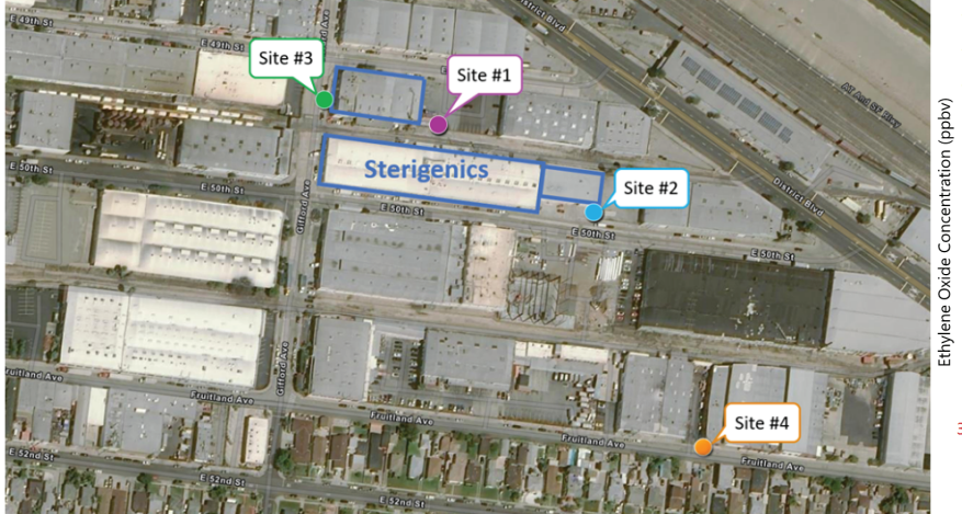
Figure 3. Map of 24-hour sampling locations