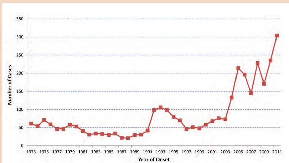
Figure 1. Annual Coccidioidomycosis Incidence (N=3,296) in LA County, 1973-2011

Except for an outbreak in 1992-1994, the annual number of cases ranged from 21 to 84 between 1973 and 2003. Increasing numbers of cases have been seen since 2004.